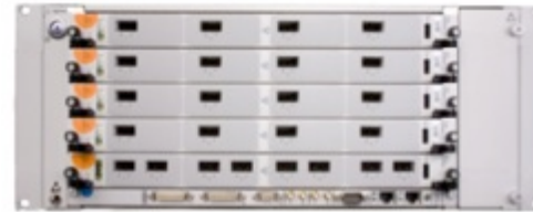
5-slot 4U integrated chassis

Embedded system modules (ESMs) allow high density routing of Wide PCIe fabric to each instrument slot, avoiding the Slot 1 ASM pin bottleneck.